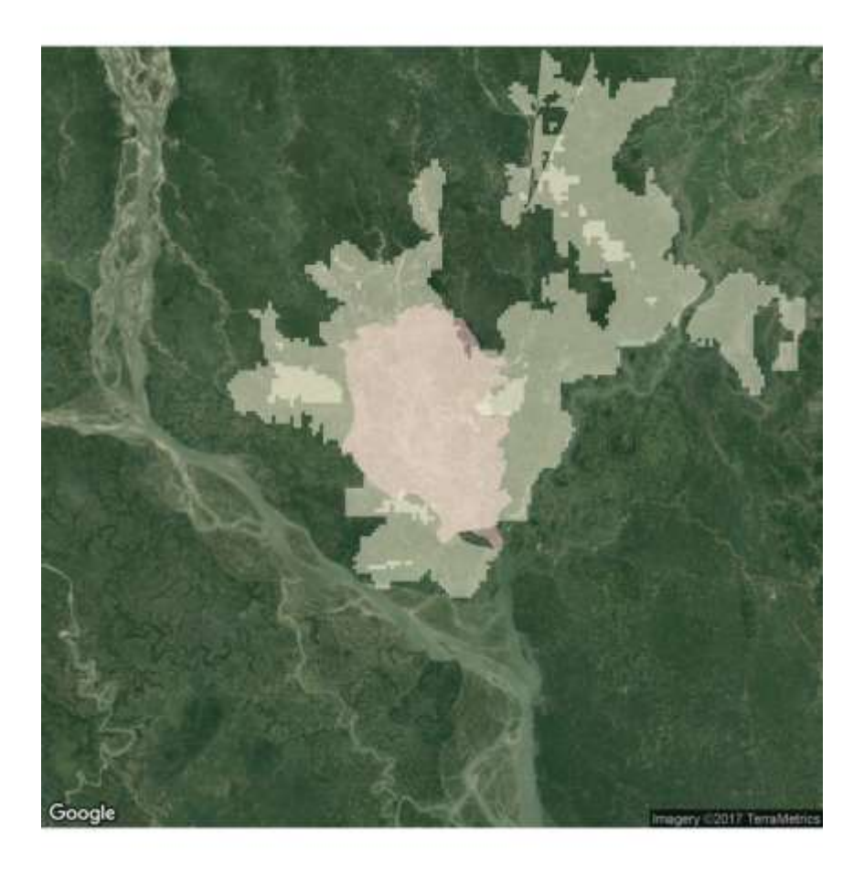
Figure 3: Dhaka