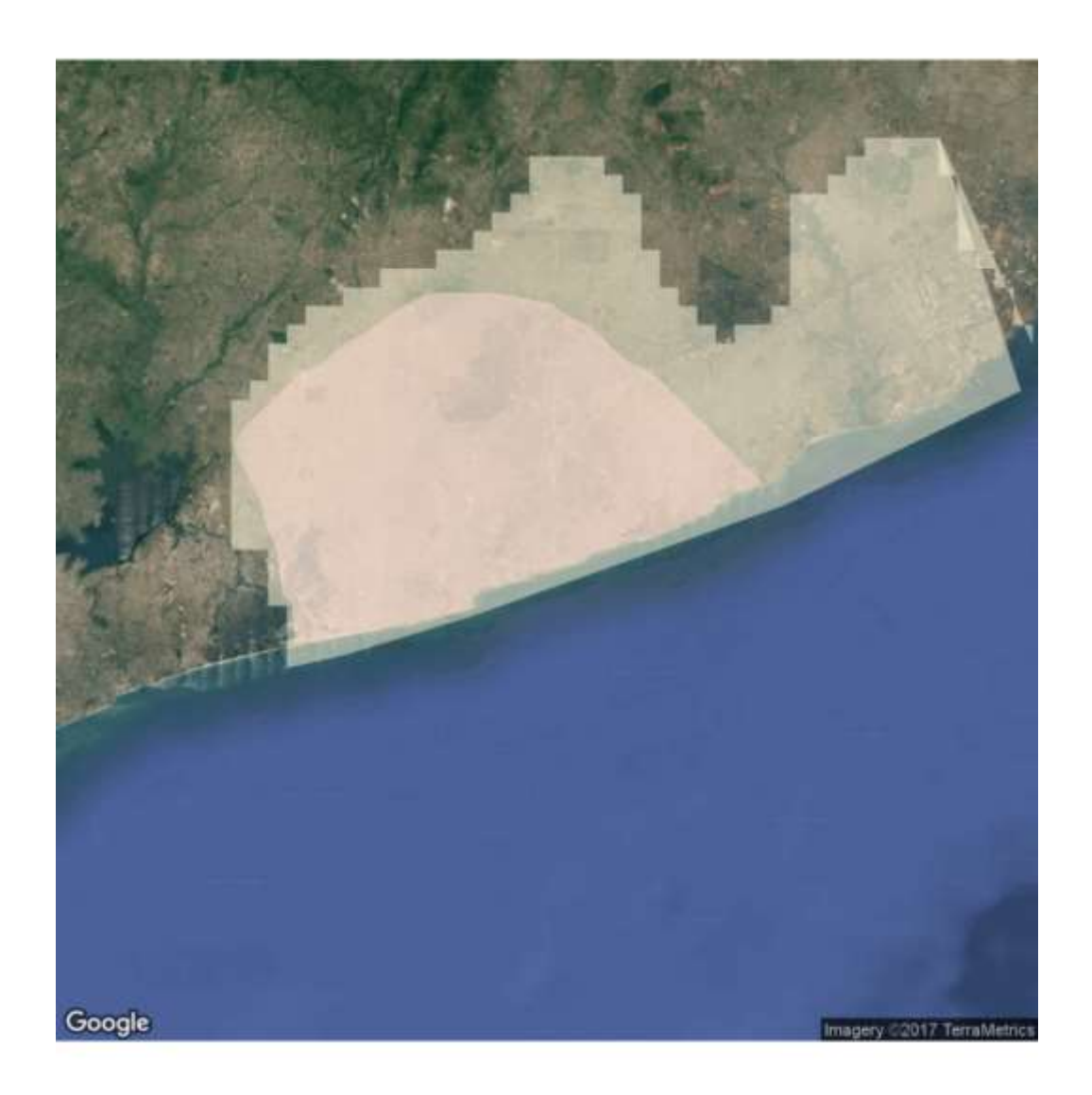
Figure 2: Accra