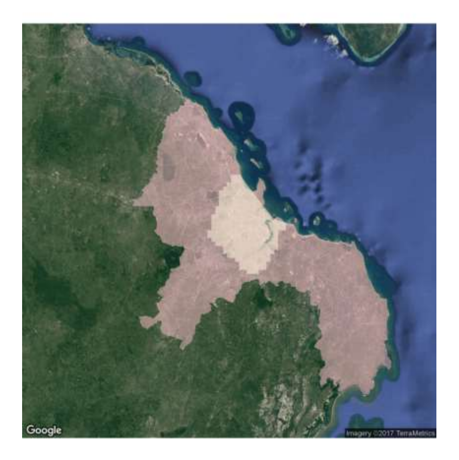
Figure 4: Dar es Salaam